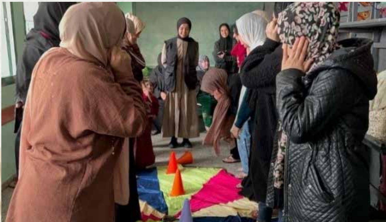
MECC-DSPR in Gaza has 103 staff to run the clinics, centers and outreach activities covering the whole Gaza strip. (MECC-DSPR)