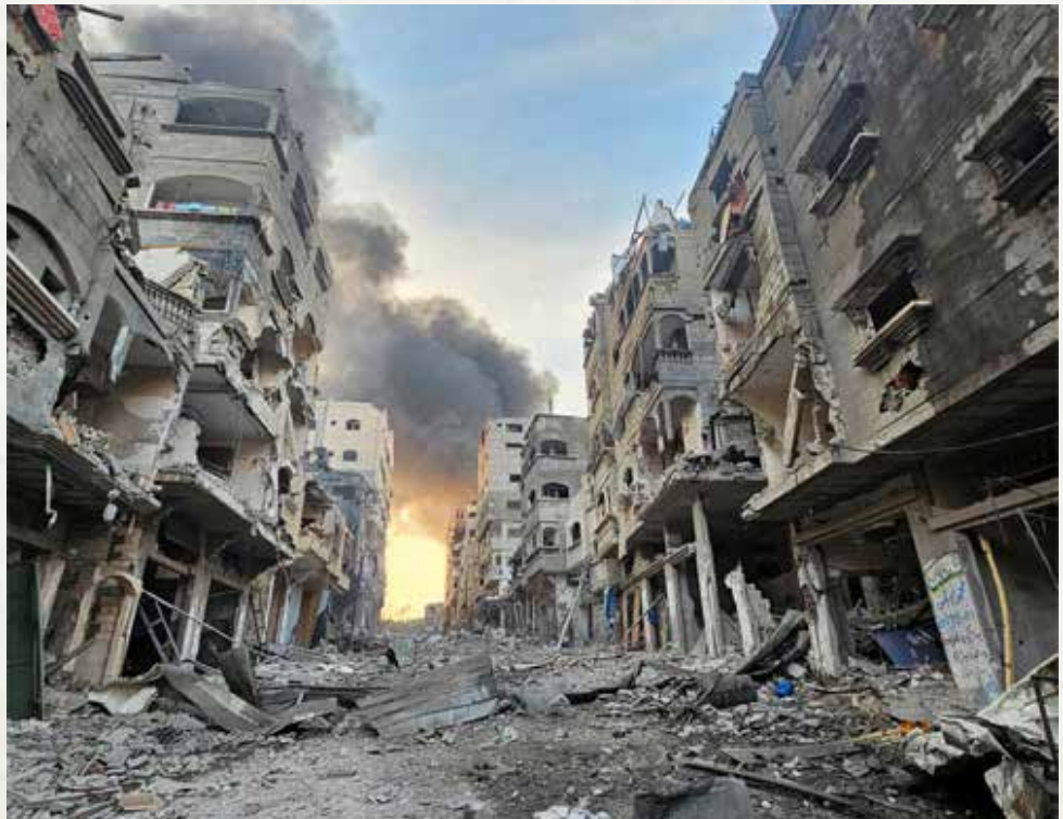
Destroyed neighborhood in Gaza.

Human rights organizations and the head of the United Nations—along with others—have declared a humanitarian disaster. Still, we don't understand how some Christians still support the ongoing indiscriminate attacks on Gaza and their country's supply to Israel of weapons, intelligence and cover from international law—in spite of the fact that Israel's colonial, racist apartheid project has turned now into an ongoing genocide.