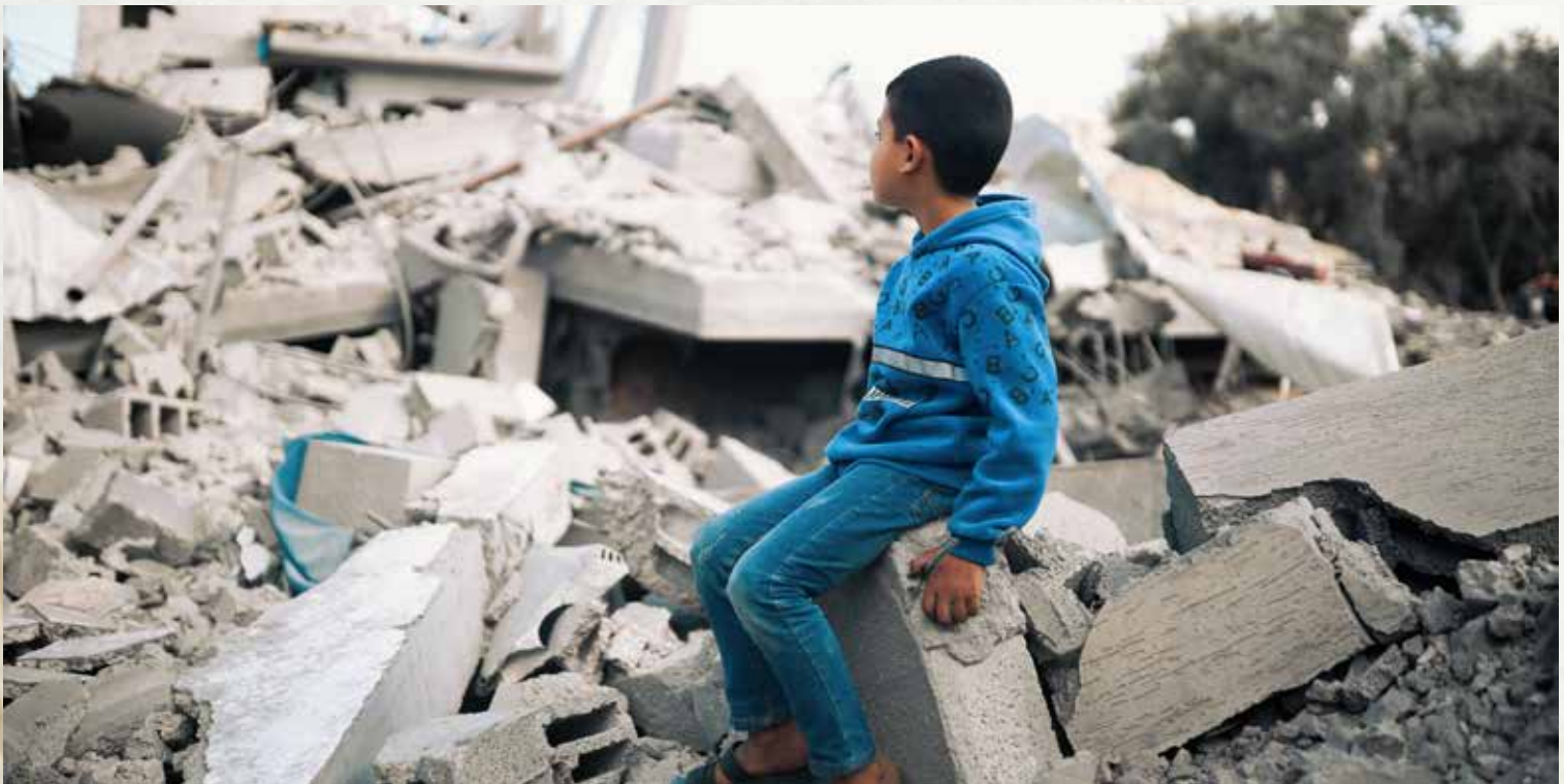
Displaced Palestinian child in Gaza sitting on the rubble of his house

About 19,000 children lost the warmth of their families or were separated from their parents during the war in Gaza, which increases the number of those without family care in Palestine to more than 70,000 children. For them, growing up is often more about survival and basic needs than playing and learning. We work at SOS Children's Villages Palestine to provide alternative care for dozens of children, focusing on the trust and warmth of strong human connections. We succeeded in opening a shelter for unaccompanied children separated from their parents due to the war in Gaza. In light of the continuing war and the economic situation that families are experiencing in Gaza and the West Bank, SOS Children's Villages has been able, over the past few months, to provide cash assistance to more than 6,700 individuals, children, and families, and has implemented more than 2,700 extracurricular and recreational